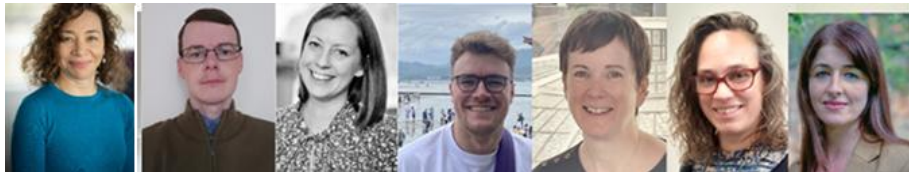
The Doctoral College team!