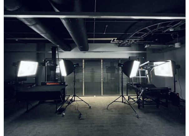
The digitisation studio, Mile End Library

Look out for a launch event in early 2026.