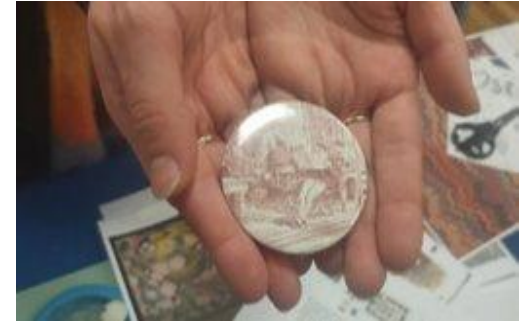
Badge making at History Day, Senate House