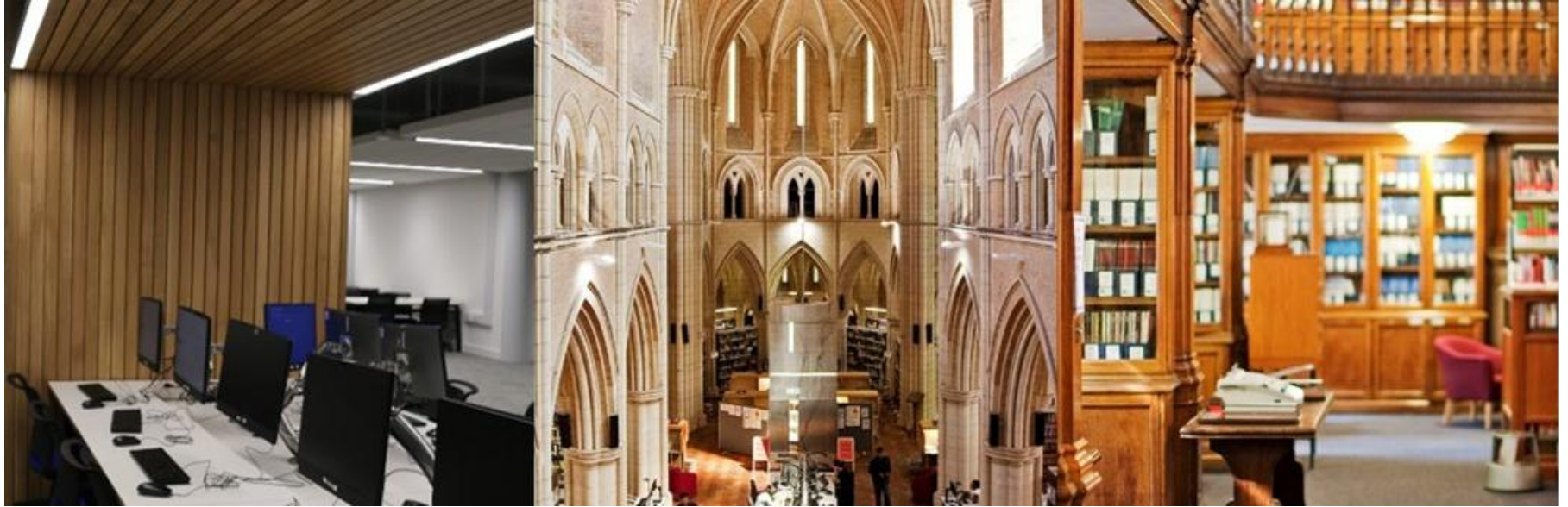
Composite image of Mile End, Whitechapel and West Smithfield Libraries