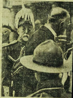
The Duke of Connaught inspecting a guard of honour at St. James's Palace to-day, when he also in

surprised he was arrested. What is the result of the enquiry?